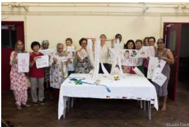
Members of the group showing their finished pieces

The exhibition opens with a private view for the participants on Tuesday 19 th April at 3pm. It will then be open daily from 11-6pm. There will be a talk about the project on Saturday 22 nd April at 2pm at the church and on Sunday 23 rd April at 11.15, after the morning service.