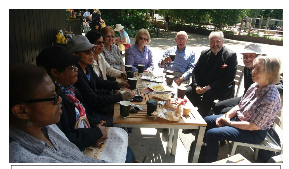
The 50+ outing enjoying some refreshments at the Walpole Park café during their July outing.