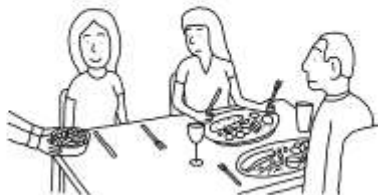
FRIENDS WHO ONLY ORDER CHIPS AT A RESTAURANT