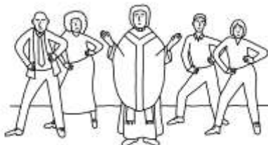
BACKING DANCERS FOR LITURGICAL ROUTINES