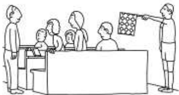
PEOPLE WHO KEEP AN EYE ON THINGS FROM THE SIDE AISLES

COMMON MISUNDERSTANDINGS ABOUT THEIR ROLE