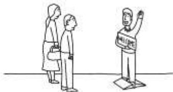
PERSONS MADE UP ONLY OF SIDES